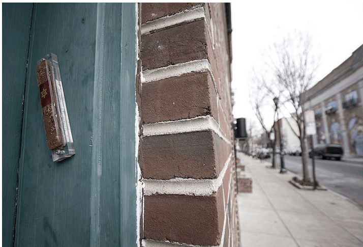
Mezuzah affixed to a door frame (South Street, Philadelphia, Pennsylvania)

A Mezuzah 1 on the doorpost identifies a Jewish home.