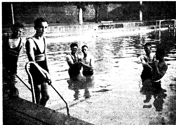
At the immersion pool—246 symbolised their consecration at 5 Convention cities in South Africa

Fired by the two stirring discourses, publishers by the thousands streamed forth from Municipal Auditorium onto the streets of Minneapolis and St. Paul to use their freedom Godlily and 'redeem the time' of the three-hour interim between the afternoon and evening sessions. There, as evening approached, against an "old world" background of traffic din and confusion, a steady, joyous hum arose within the "Twin Cities" from the lips of happy ambassadors of the New World. Puzzled passers-by on the street corners heard the firm, assuring calls of 'Are you looking ahead to the New World?' 'The truth shall make you free.' 'Assemble for peace and prosperity,' 'Seek the only light,' 'Read The Watchtower ,' 'Read Consolation .' Then they reached for the leaflet held