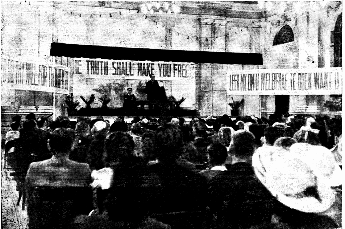
(1) Taken during the history-making two-hour program on Saturday, August 21, from the key city, this picture shows the president of the Watchtower Society delivering the discourse on 'Free Education for Men of Good-Will'. Visible seated are the vice-president of the Society and its secretary-treasurer. (2) The South African Branch servant puts over the speech on 'Freedom in the New World' to an attentive audience at Johannesburg.