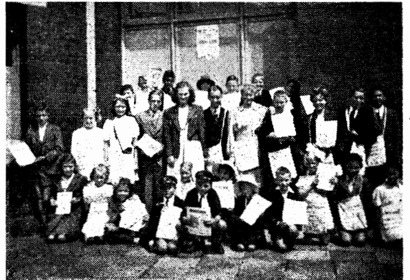
Young magazine publishers on the Golden Reel

This long-anticipated speech was now history, so far as its delivery was concerned. But it will live on in printed form and accomplish its purpose by having a wide distribution among men of good-will. (Now, just three months after its release, more than seven million copies have been printed.) Free personal copies were given to all those in attendance, along with extra copies that they might give to interested persons. Thus, once more, was emphasized the policy of "free education for men of good-will".