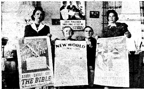
Jehovah's witnesses believe in "Signs"

"Although worldly governments must recognize this right [freedom of worship], they can no more grant to Jehovah's witnesses the liberty to worship God than they can give to God the liberty of receiving such worship. The immortal freedom to preach as a minister of Almighty God soars high above the reach of earthly powers, or decrees. Today, in all the earth, there is but one people who enjoy freedom of worship. It cannot be taken from them. Who are these people? Jehovah's witnesses! "