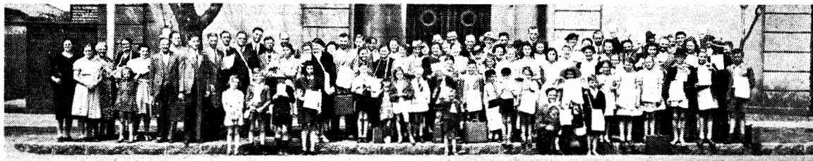
A happy group of witnesses from the Northern Transvaal all set for the fray