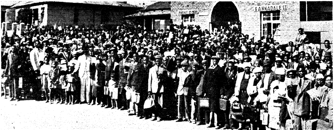
Some of the African witnesses who assembled at Johannesburg from many parts of the Transvaal. They look forward to the full establishment of God's Kingdom.

"A greater attendance was had at this gathering