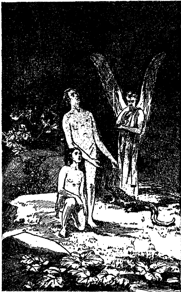
UNOINTED CHERUB—Commercial Iniquity Begins Page 95